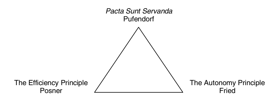
FIGURE 2. THE SECULAR JUSTIFICATION TRIANGLE